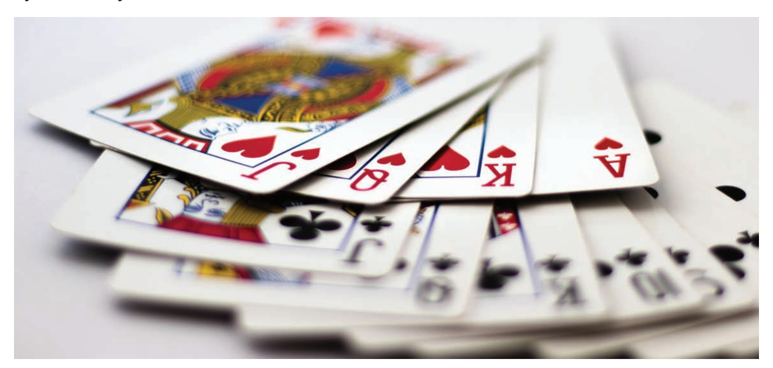
Many financial institution executives spend considerable time thinking about strategies to improve overall profitability and create sustainable growth.

The focus on best practices is generally aimed at strategies to cut expenses: using technology, looking at staffing levels and increasing productivity, among others. Although this advice is sound, is that actually what high-performing banks do? To answer this question, we analyzed data for 81 institutions that have been in the top five for return on equity for five consecutive years to peers. These institutions averaged an efficiency ratio of 52.04%.