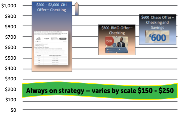
Acquisition Cost (assumes additional cost for marketing)

In addition to the cost of the offer, these largest banks spend a significant amount of marketing dollars to gain new core relationships and the benefits that come with them. When a financial institution does not commit to an always-on marketing strategy, it must provide above market offers to "buy" new relationships.